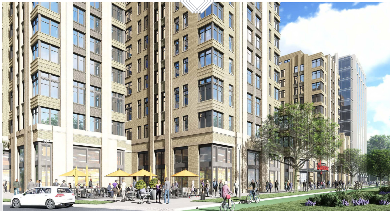
TWINBROOK QUARTER, ROCKVILLE, MD

Metrorail Orange and Silver Lines in Arlington, Virginia, opened in 2020. Ashbrook Marketplace, our newest grocery-anchored shopping center, located in Ashburn, Virginia, opened in 2019.