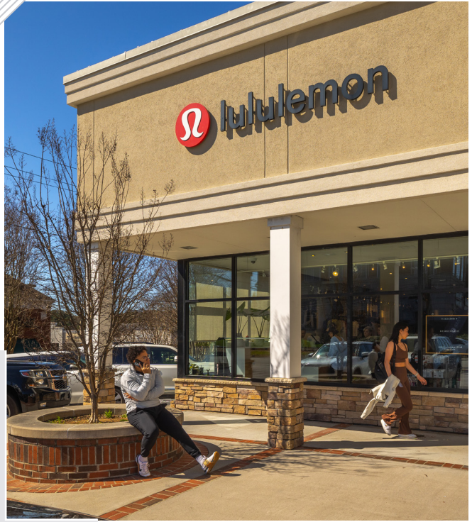
THRUWAY, WINSTON-SALEM, NC

House, respectively. Additionally, our dividend reinvestment plan supplements our borrowing availability and operating cash flow to ensure adequate liquidity.