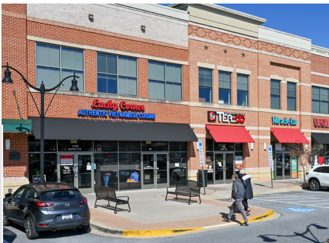
WESTVIEW VILLAGE, FREDERICK, MD

In recent years, we have grown organically through ground-up development. Park Van Ness, a residential mixed-use property along the Metrorail Red Line in upper Northwest Washington, DC, opened in 2016. The Waycroft, a mixed-use property with residential and retail along the