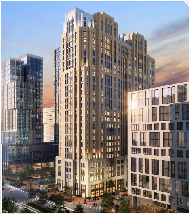
HAMPDEN HOUSE, BETHESDA, MD