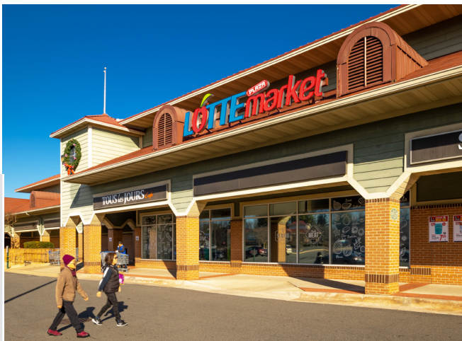
COUNTRYSIDE MARKETPLACE, STERLING, VA

Our four office mixed-use properties are all located in the greater Washington, DC region. The office market continues to be challenging. In 2023, approximately 230,000 square feet of expiring leases at an average $38.68 per square foot were renewed or re-leased at an average $36.70 per square foot, a 5.1% decrease. Nevertheless, in spite of office market headwinds, our office leased percentage increased 350 basis points during 2023, from 82.5% to 86.0%. Only 5.5% of leases at our office mixed-use properties, as measured by annual base rent, are scheduled to expire in 2024.