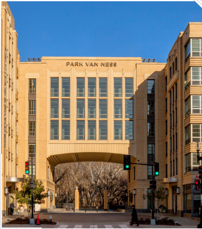
PARK VAN NESS, WASHINGTON, DC

Residential same-property operating income increased 13.0% from 2022 to 2023.