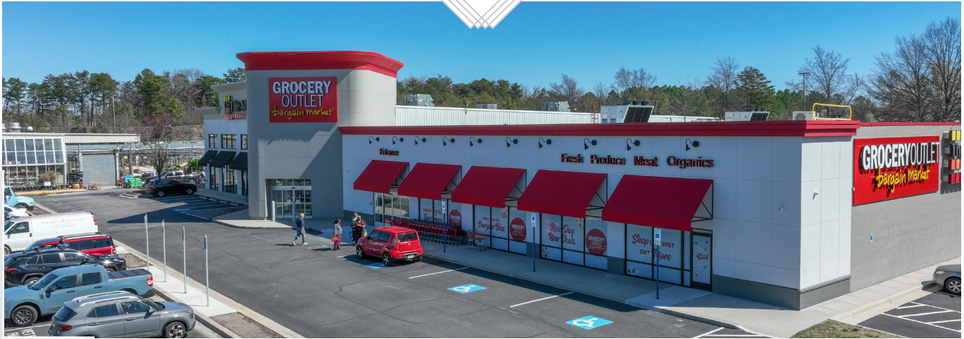
SOUTHDALE, GLEN BURNIE, MD